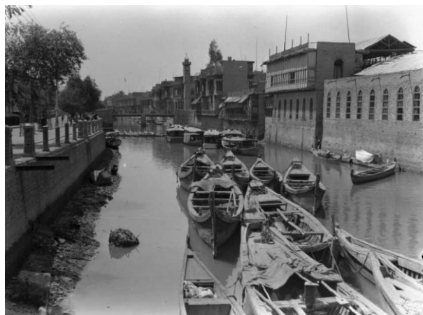
Canal with canoes, southern Iraq, 1944