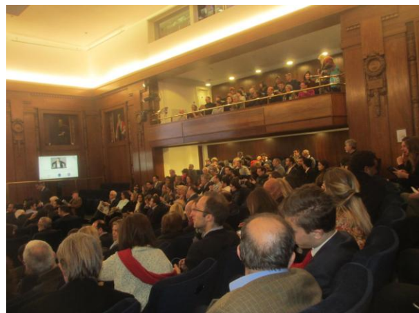
The audience at Bernard-Henri Levy's lecture on Iraq at Savoy Place, 25 April 2017