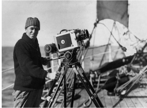
Frank Hurley (1885-1962)

The Australian National Library holds Hurley's photographic collection, containing photographs taken by him between 1910 and 1962, including these 1944 photos of Iraq. Hurley also took photographs of Syria, Palestine, Jordan, Egypt, Libya and Sudan and many other countries.