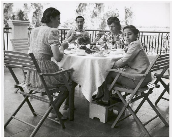
Breakfast at the palace, 1944. King Faisal II (9 years old) is photographed with his uncle, Crown Prince Abdul Illah