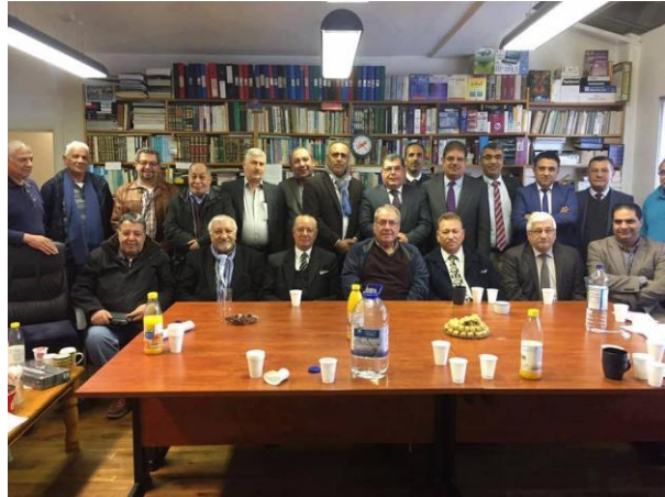
London Dialogue Forum Event, 22 April 2017

The purpose of this forum was for Iraqi academics, professionals and community activists in the UK to discuss some issues affecting Iraq, and to attempt to find suggested resolutions and recommendations to be sent to decision-makers in Iraq.