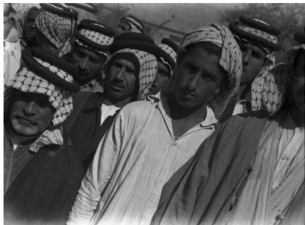
Scenes from the Iraqi marshes. Photographs taken by Frank Hurley, 1943 and 1944.

مركز الدراسات الإنكلوية العراقية ANGLO-IRAQI STUDIES CENTRE