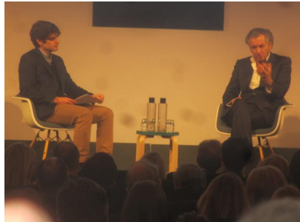
Bernard-Henri Levy talking about Iraq