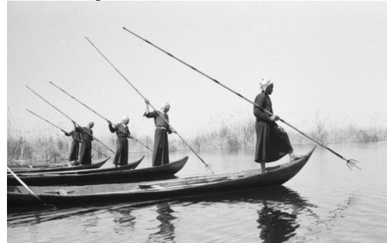
Iraqi marsh dwellers above and below