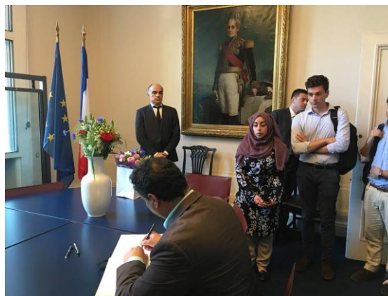
Signing the book of condolence, French Embassy