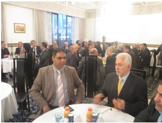
The AISC team attend Iftar at the residence of the Iraqi Ambassador to the UK, 1 July 2016 (above and below)