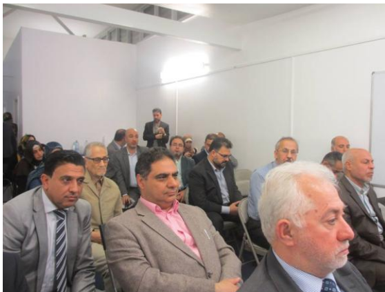
Religious education event, 14 July 2016