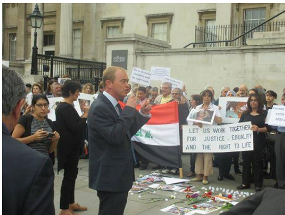
Tim Farron MP, Liberal Democrat Leader, attending the Iraqi vigil in Trafalgar Square on 6 July 2016