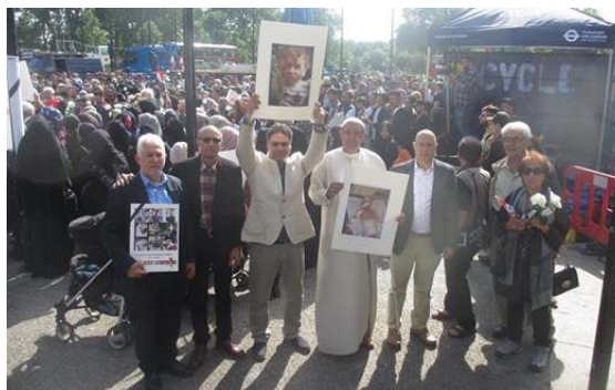
Marble Arch Iraqi vigil on 10 July 2016