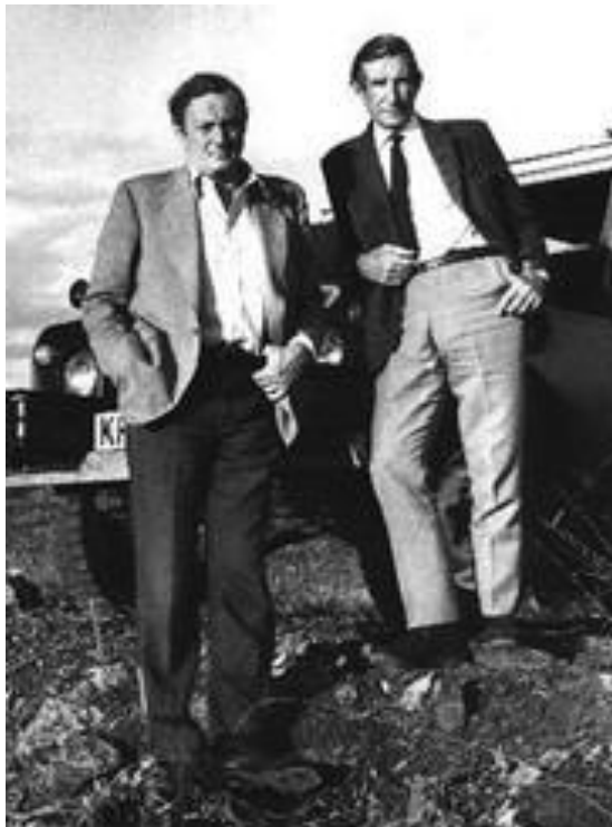
Gavin Young (left) and Wilfred Thesiger (right)

Some 17 years after leaving the Iraqi marshes, Young returned in 1973 and lived there again for some time. His experiences of returning to the marshes after 17 years are documented in the above book. Young published a further book in 1980 about his time in Iraq, titled " Iraq: Land of Two Rivers, Travels in Mesopotamia ".