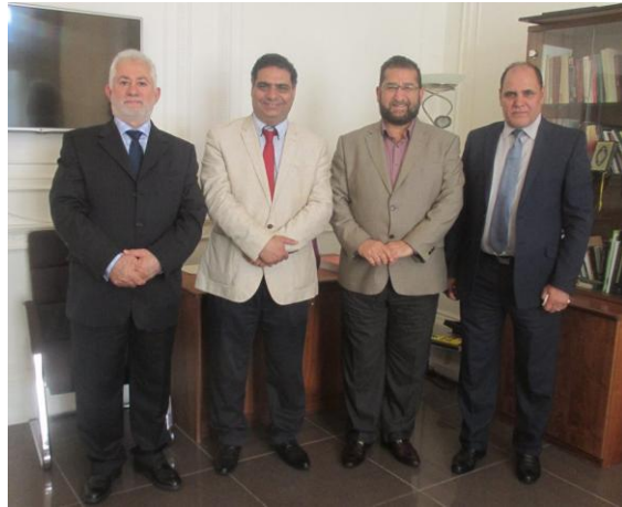
Saying farewell to the outgoing Iraqi Consul at the Iraqi Embassy, 19 July 2016 (above and below)