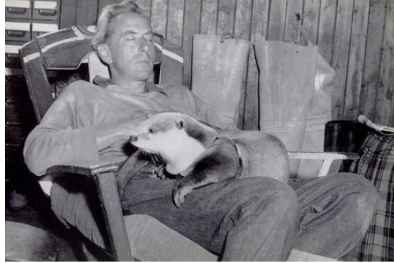
Gavin Maxwell with his pet otter, Mijbil, found in the Iraqi marshes. Mijbil was recognized as a new, unknown species of smooth-coated otter in the UK

Maxwell's book, "A Reed Shaken by the Wind" published in 1957 was later published in the US under the title "People of the Reeds" in 1966. In 1960, Maxwell also published a book titled "Ring of Bright Water", about how he brought an otter from Iraq, named Mijbil, and raised it in Scotland in 1956. This was registered as a new species of smooth-coated otter by the London Zoological Society. Maxwell's book "Ring of Bright Water" was adapted as a film released in 1969.