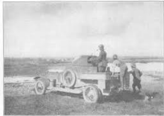
Armoured car in Mesopotamia on reconnaissance