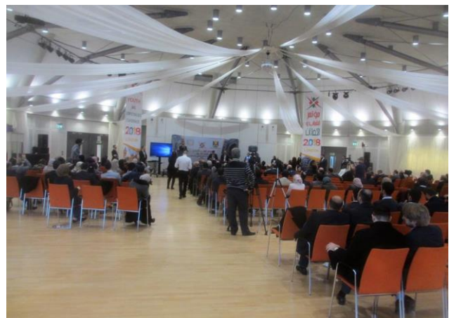
Above: Brent Town Hall, Wembley