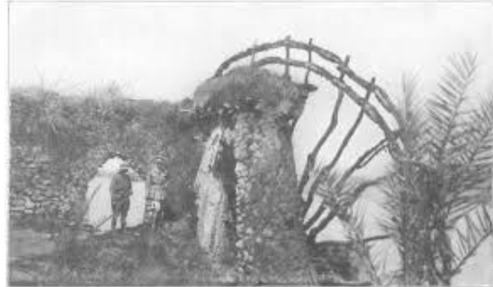
Water wheel on the Euphrates