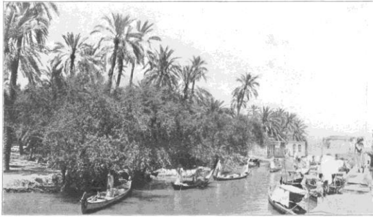
Ashar Creek, Basra