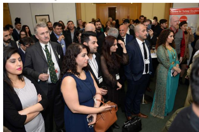
The Kurdish community celebrating Nawroz at the UK Parliament