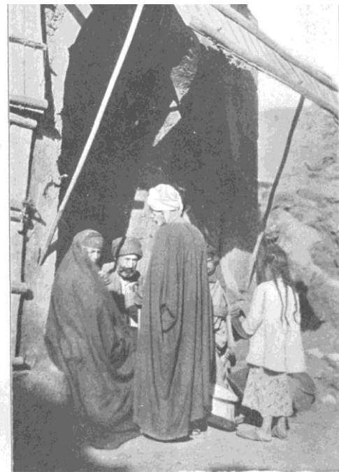
Jeweller's booth in a Mesopotamian bazaar

These photographs were published in "War of the Garden of Eden" by Kermit Roosevelt (1889-1943)