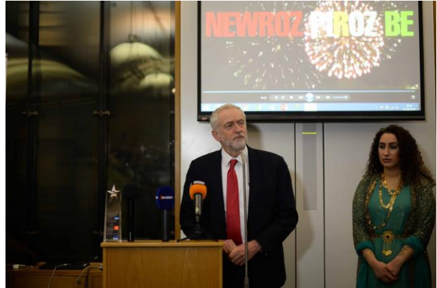
Labour leader Jeremy Corbyn celebrating Nawroz with the Kurdish community

Many representatives from Iraqi and Kurdish political and community organisations attended the event.