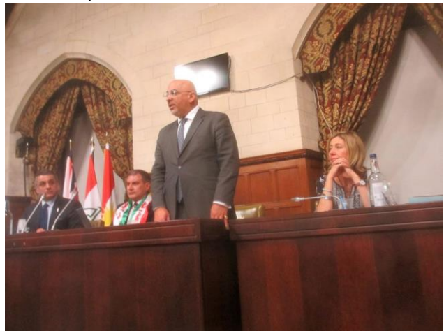
British MP and government minister Nadhim Zahawi at the UK Parliament