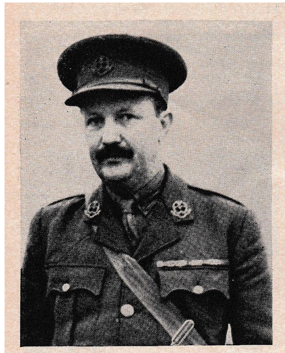
Major Kermit Roosevelt (1889-1943) pictured in his later years, during the Second World War. He served with the British Army in Mesopotamia during the First World War