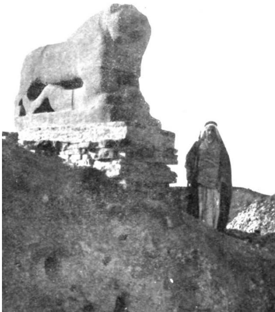
The Lion of Babylon