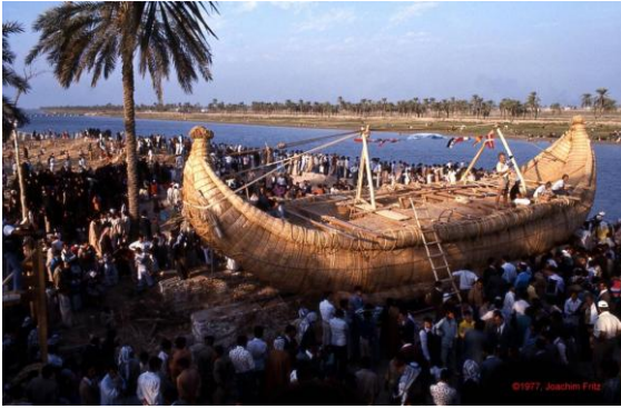
Heyerdahl's "Tigris" ship under construction, southern Iraq, 1977