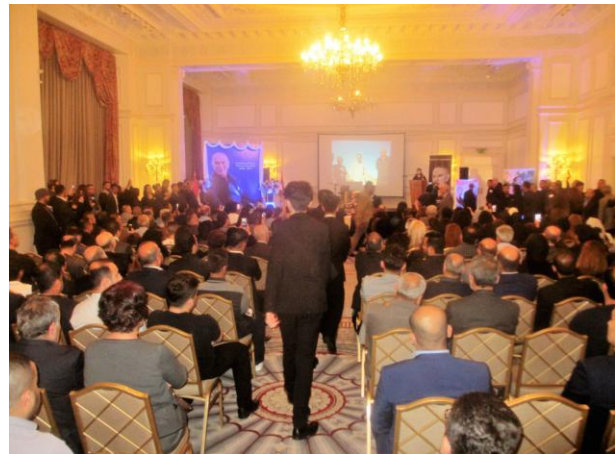
Guests gather to remember Nawshirwan Mustafa at the Landmark Hotel, London, 28 May 2017

On 28 May 2017, representatives from the AISC team attended this event held to mark the passing of Mr Nawshirwan Mustafa (1944-2017), General Co-Ordinator of the Kurdish Movement for Change (Gorran) and the leader of the opposition in Iraq’s Kurdistan region. This event was attended by hundreds of members of the Kurdish and Iraqi communities.