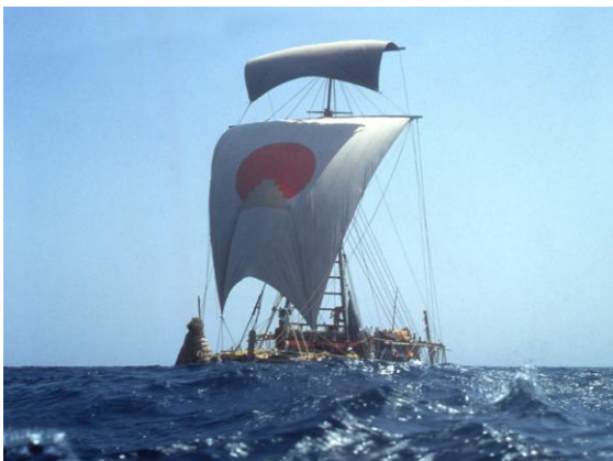
The Tigris, built in Iraq in 1977 by Heyerdahl, sailing to the Gulf, Indian Ocean & Horn of Africa