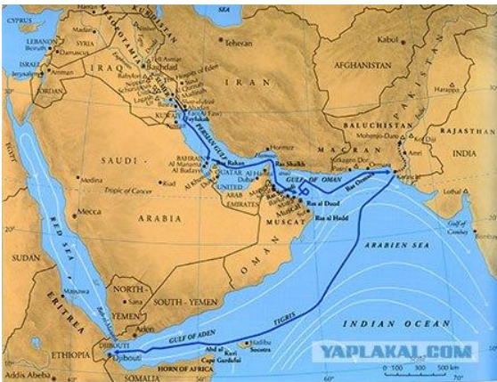
Heyerdahl's route from Iraq to the Gulf, Indian Ocean & Horn of Africa, Djibouti (1977-1978)