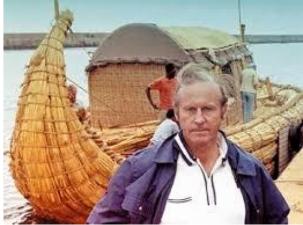
Thor Heyerdahl (1914-2002) built many ships in traditional styles, to cross oceans and led many famous sea expeditions (1947;1969;1971;1977).