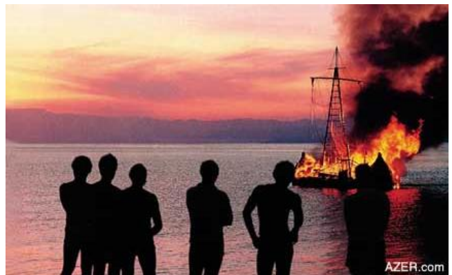
The burning of "The Tigris", 3 April 1978 at the Horn of Africa, Djibouti