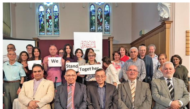
Iraqis standing in solidarity with Manchester, 25 May 2017

On 25 May 2017, the AISC team attended an event in Hammersmith, London. This event was organised by the Iraqi Association, about the suffering of Iraqi minority groups in Mosul. The Iraqi community attending also showed their solidarity with the city of Manchester in the aftermath of the dreadful terror attack there three days earlier.