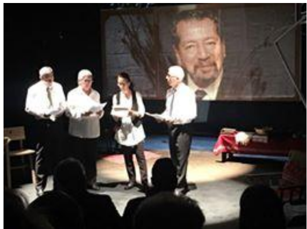
Remembering the Iraqi actor Khalil Shawki