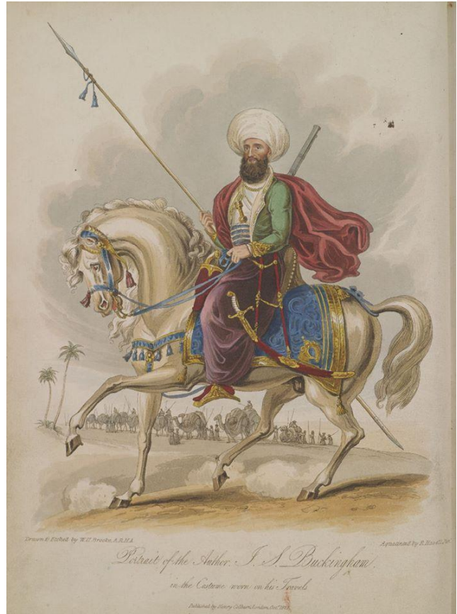
Above: Sir James Silk Buckingham travelling from Baghdad to Persia (Iran) on horseback dressed as an Arab nobleman, 1825

In those days, travelling to Mesopotamia and neighbouring lands was fraught with danger and travellers such as Silk Buckingham relied on the local tribal leaders for their protection during the time they spent in Mesopotamia. Western travellers were regarded with suspicion by natives, who were often hostile to them.