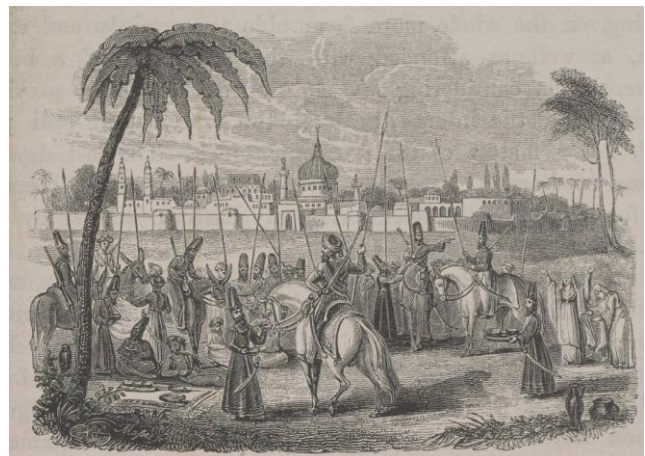
Above: Mesopotamia in 1825, from a painting in the book "Travels in Mesopotamia" (pub. 1827)