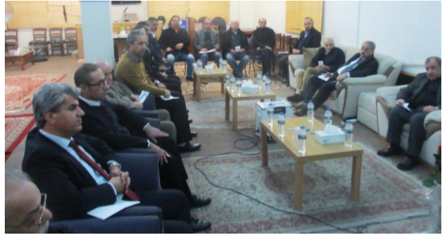
Members of Iraq's political and community groups at the Al-Hakim Foundation offices, London

At this meeting, a smaller steering group was established to follow up on the above tasks.