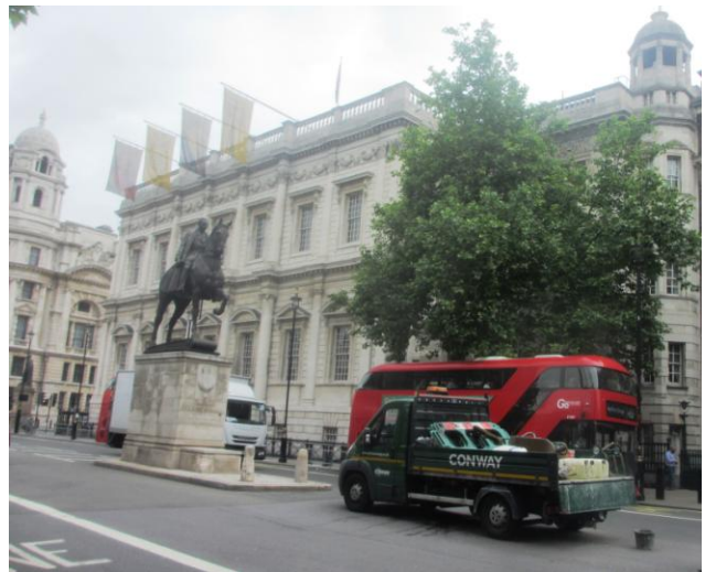
Above: RUSI, Whitehall, London