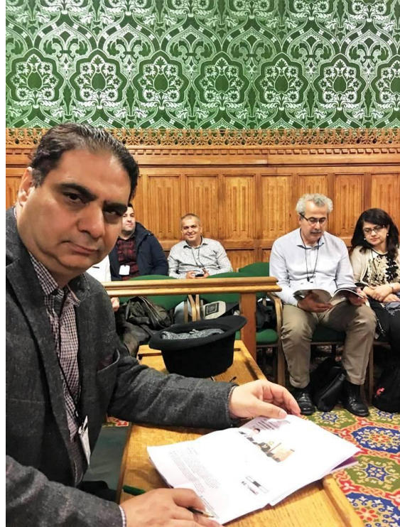
UK Parliament, London (above and below)

This event was held to bid farewell to the sheikh of the Arab B'dour tribe in southern Iraq, who had been visiting London for a few weeks. Members of the Iraqi community, including members of his B'dour tribe, organised this event in the presence of the Iraqi Consul and other guests.