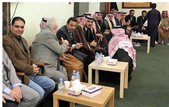
Above: Iraqi community event, 2 November 2017