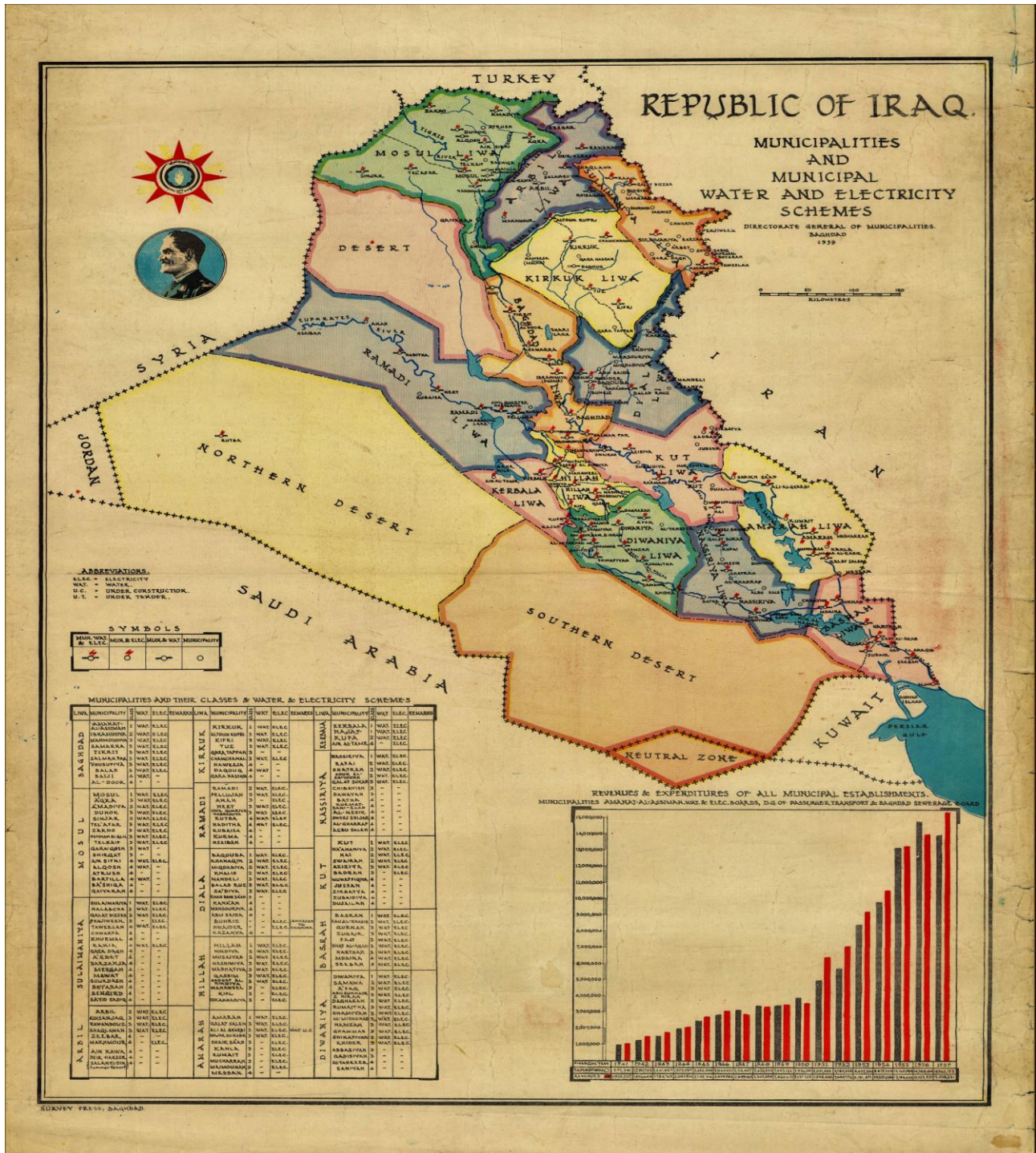
This map was issued in 1959 by Iraq's Directorate-General of Municipalities, showing their 20 years of work in all provinces (liwas), municipalities and which areas are served by water and electricity.