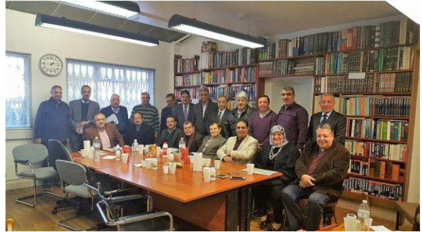
Above: Iraqi Consultative Association for Development & Progress, 19 November 2017

Within the next 12 months, the ICADP intend to gather these reports together and publish a critically informed blueprint for reform in Iraq.