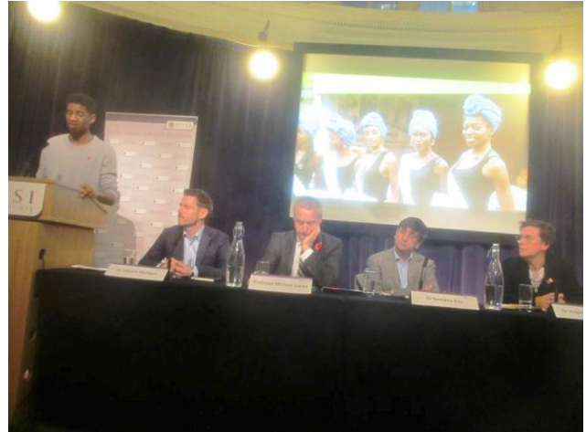
RUSI event, "Remembering the Unremembered", London, 7 November 2017