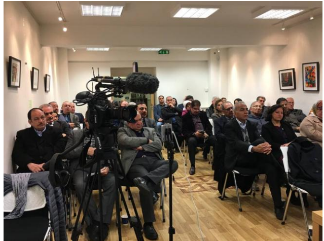
Above: the audience attending knowledge presentations at Salam House, November 2017