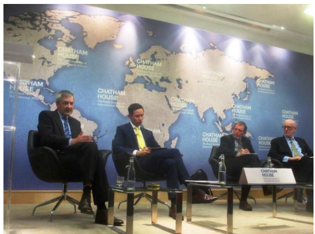
Chatham House event, London, 29 November 2017