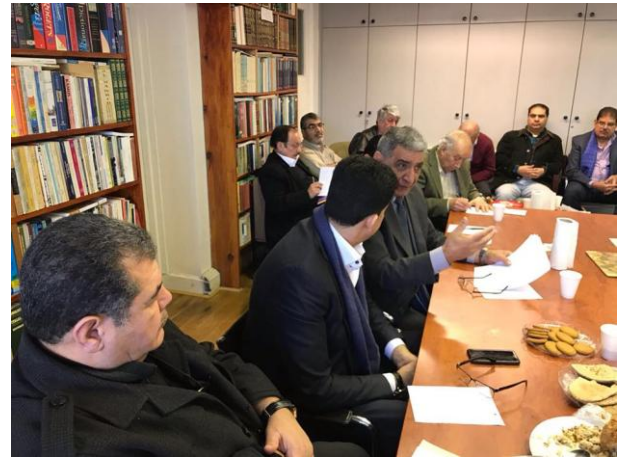
Above and below: Iraqi Consultative Association for Development & Progress, 26 November 2017